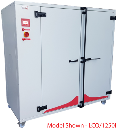
Model Shown - LCO/1250H/TDIG/AWA