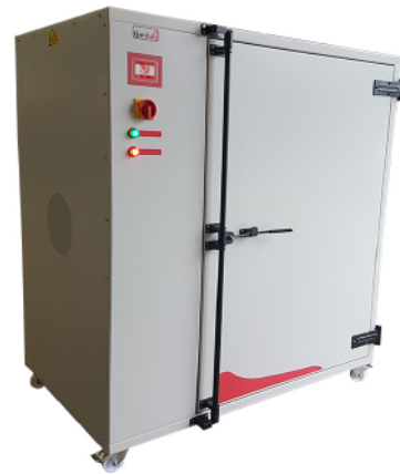
Model Shown - LCO/750V/TDIG

The Genlab range of Large Capacity Ovens offers a selection of highly efficient, reliable and cost effective ovens to suit most warming, drying and heat treatment processes. They feature our latest touch screen control system which offers intuitive control and excellent accuracies designed for industrial and laboratory ovens.